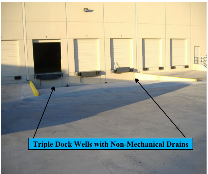
Triple Dock Wells with Non-Mechanical Drains